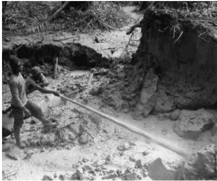
Hydraulic gold miners in Suriname, South America.