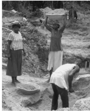
Sand miners in Ghana, West Africa.