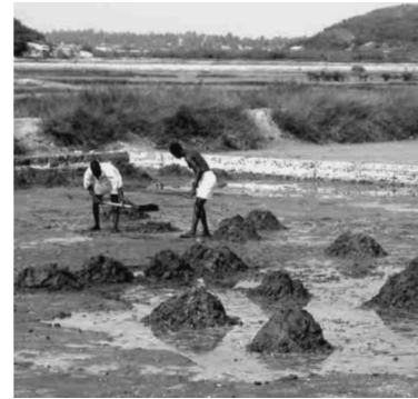
Manual salt miners in Ghana, West Africa.