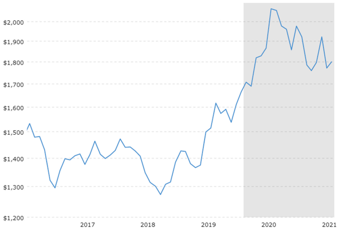
Fig. 3. Development of international gold prices, 2016–2021. (For interpretation of the references to colour in this figure legend, the reader is referred to the Web version of this article.)

continued to transport passengers to, from, and within ASGM communities.